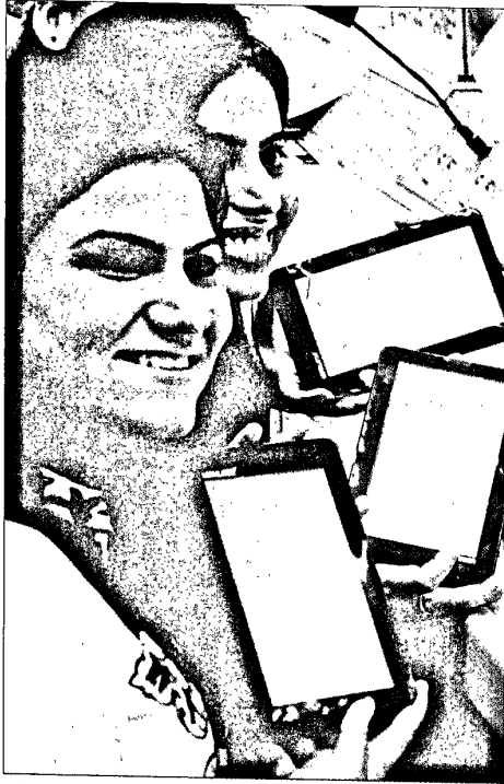
Aakash, inexpensive yet effective.

Aakash, the inexpensive tablet, was the high point for education in a year that also saw efforts to revamp entrance tests for engineering and medicine. In health, the key events were the Japanese encephalitis outbreak in several states, besides the controversial launch of an influenza vaccine