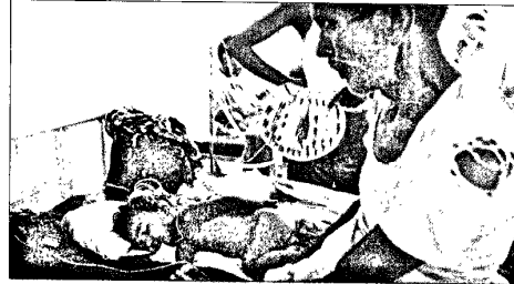
Encephalitis, a battle yet to be won.

NCHER BILL: Pending since 2009, the legislation that promises to change the higher education system, replacing multiple layers of regulatory authorities with a single National Commission for Higher Education & Research, has finally found consen-